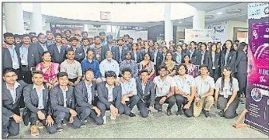
హ్యాకథాన్లో విద్యార్థులు, అధ్యాపకులు

మేడల్ రూరల్: గుండ్లపోచంపల్లి మున్సిపాలిటీ పరిధి మైనమ్మగూడలోని ఎమ్మార్సీఈ కళాశాలలో ట్రిబ్యుల్ ఐటీ, స్వేచ్ఛ- విశ్వం ఏఐ ఆధ్వర్యంలో